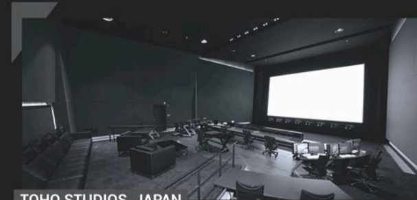
TOHO STUDIOS, JAPAN

Film mixing facilities of the original Godzilla movie.