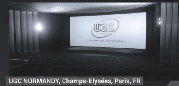
UGC NORMANDY, Champs-Elysées, Paris, FR