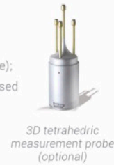
3D tetrahedric measurement probe (optional)