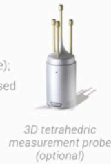
3D tetrahedric measurement probe (optional)